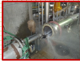
UHP Piping Washing