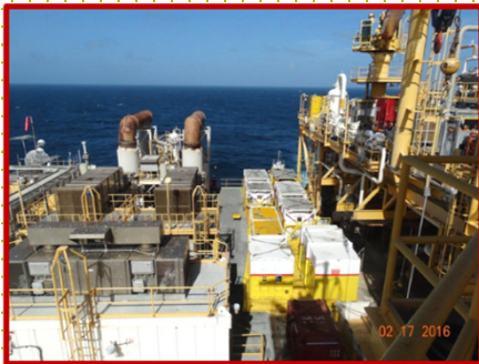
Flushing, Purging & Helium Leak Testing