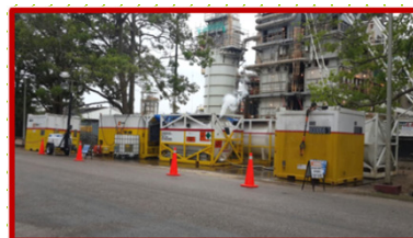
Nitrogen Purging –Catalyst Work