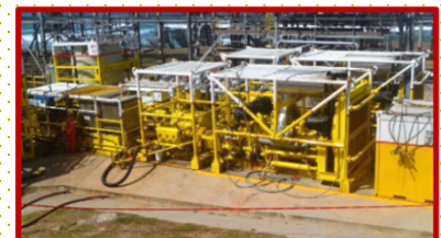
Pipeline Pigging & Hydrotesting